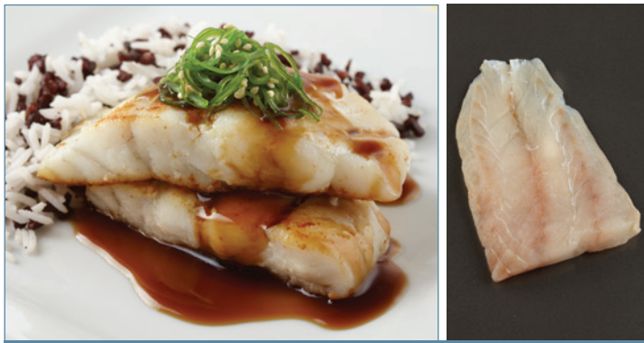
Ponzu Glazed Grouper with Steamed Black and White Chinese Rice